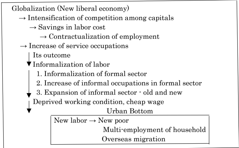
Figure 1. Globalization and Labor